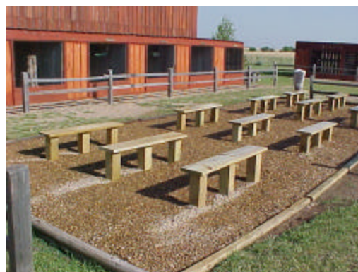
EVRC's new seating area

Our next Eagle Scout project will be to add a pergola roof over the seating area, similar to the one over our pavilion extension, for shade.