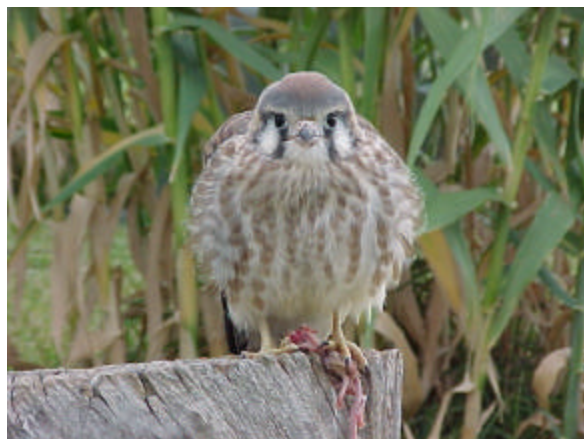
Our “Boeing Baby” American Kestrel, poses briefly for the camera while she partakes of a small snack.